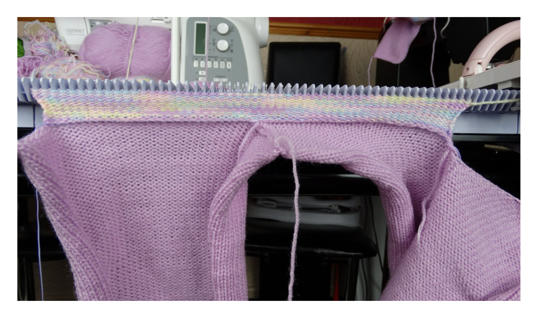
Pick the 26 stitches for rib back neck and 29 stitches for front of left neck only. With yarn (for welt) and ravel chord together, knit 1 row. With only yarn in the yarn feeder knit 11 rows. Pick up loops to form rib and cast off.

NOTE: Neckband is not a mock-rib. Stitches are picked up (like in mock-rib) to make the neckband firm. The ravel chord is used together with the yarn to knit 1 row, because the multi yarn has a colour that the bodice of the garment has ( we want to know the row where the loops will be picked to form the neckband).