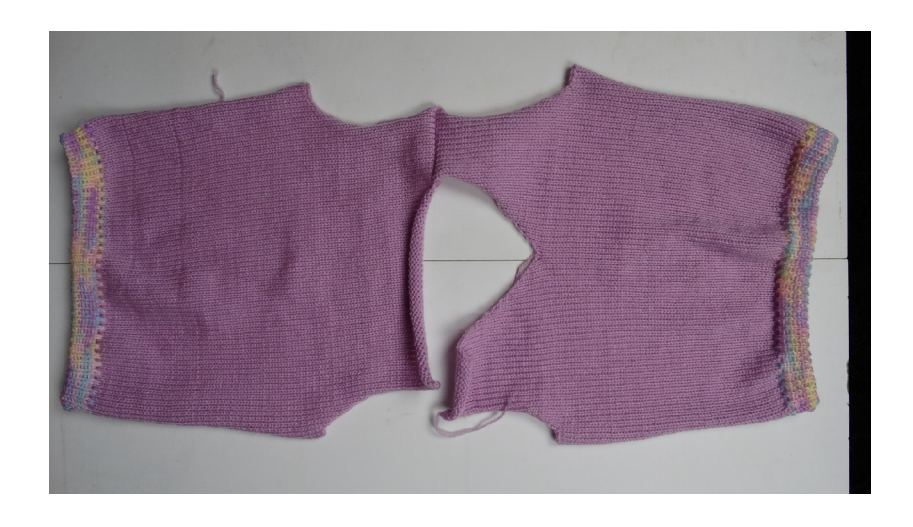
STEP 2: place right front shoulder to the right back shoulder (this is to make a mark because of the shoulder joining later on and also the neck band for the back of sweater). Place a pin on the inner part of the shoulder of back but do not pin to the front.