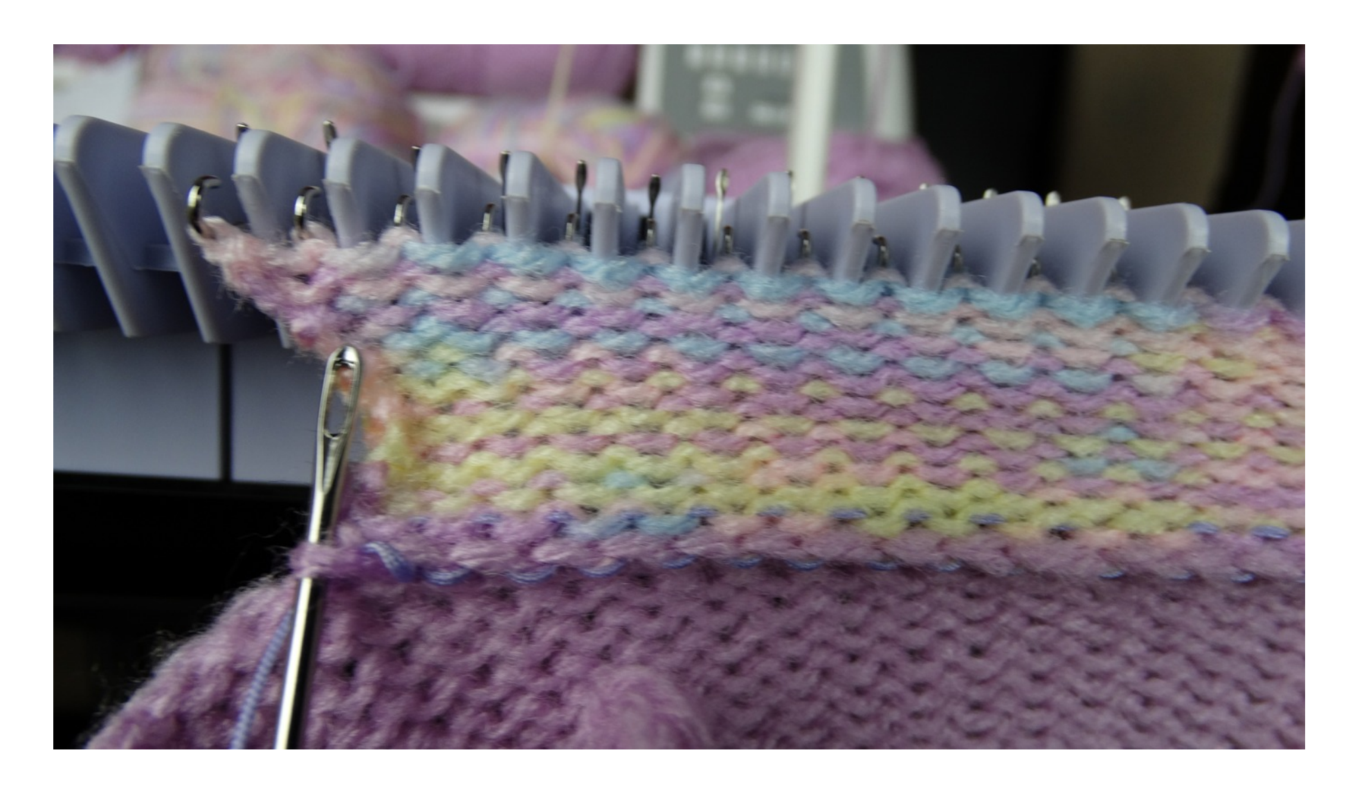
STEP 4: pick up 28 stitches for front right neck and knit rib as for back neck and left neck of garment.

STEP 5: join front right shoulder to right shoulder back. Sew with a sewing machine,