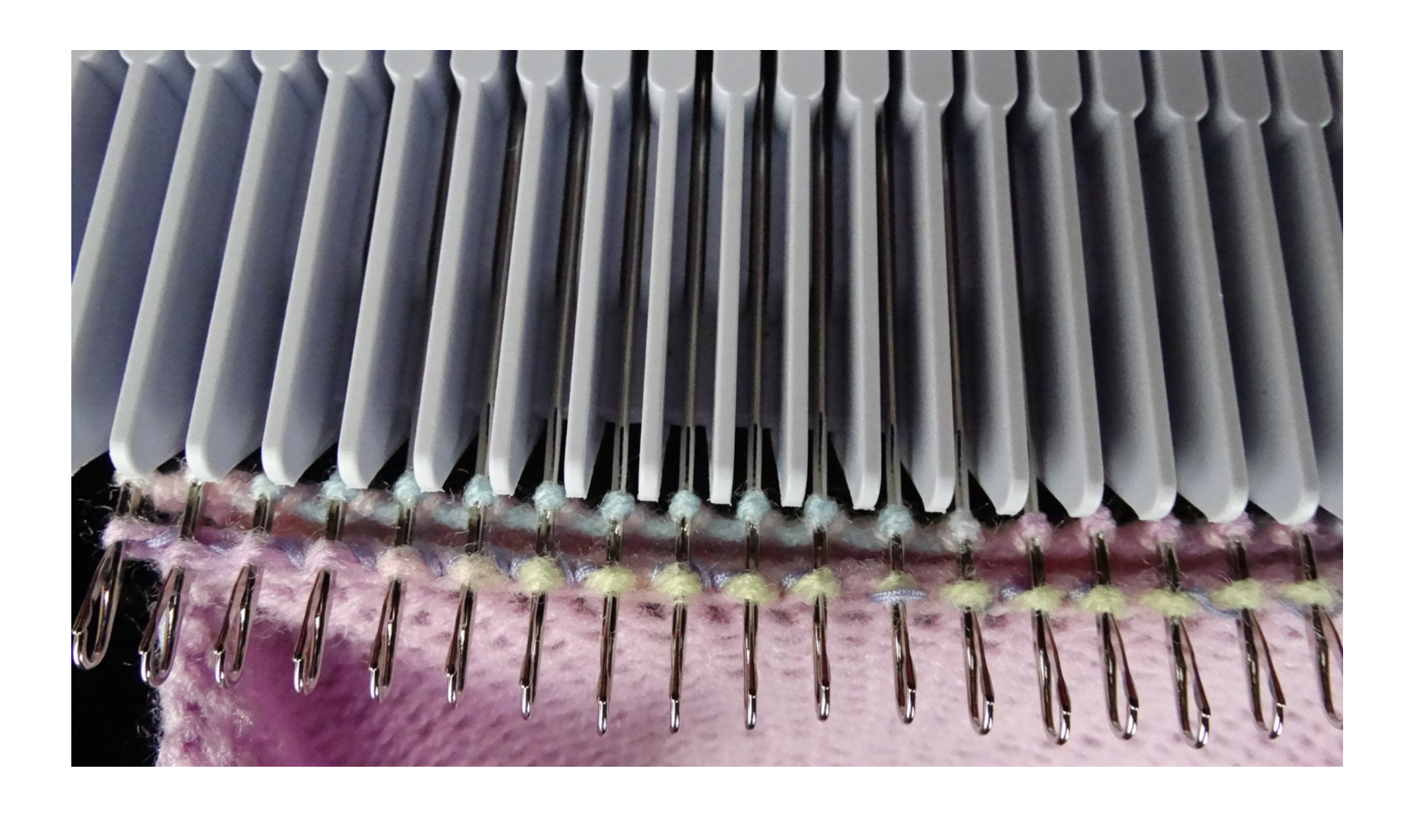
STEP 7: overlap the front of sweater neck and with a tapestry needle and yarn, sew the overlapped neckband. Darn all loose yarns.